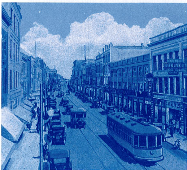
King Street West, Kitchener, 1929

Susan J. Hoffman Local History Fund Contributions complement the projects relating to the Grace Schmidt Room. Donations are payable to the Kitchener Public Library Foundation.