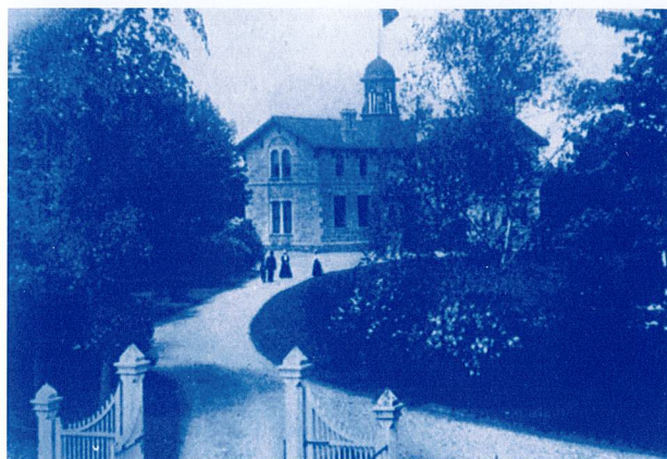
Galt Collegiate Institute before 1900

Public meetings of the Society with speakers on local history are held throughout the year in various parts of the region.