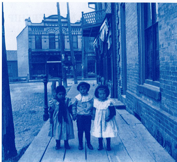
Children on Stanley Street in Ayr before 1901

Susan J. Hoffman Local History Fund Contributions complement the projects relating to the Grace Schmidt Room. Donations are payable to the Kitchener Public Library Foundation.