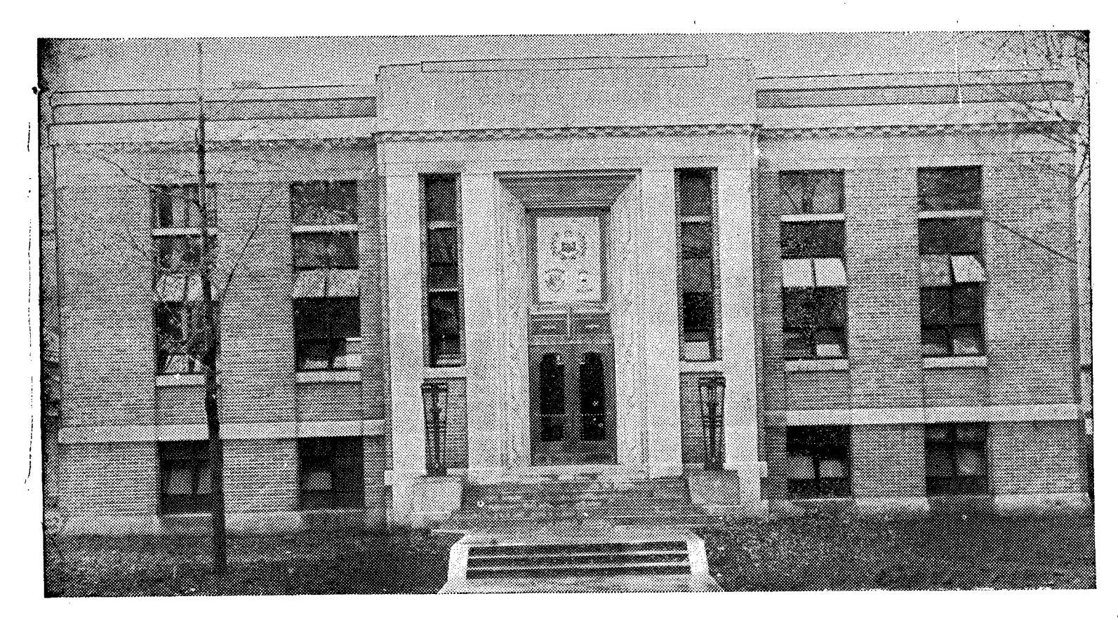
REGISTRY OFFICE, WATERLOO COUNTY ERECTED 1939