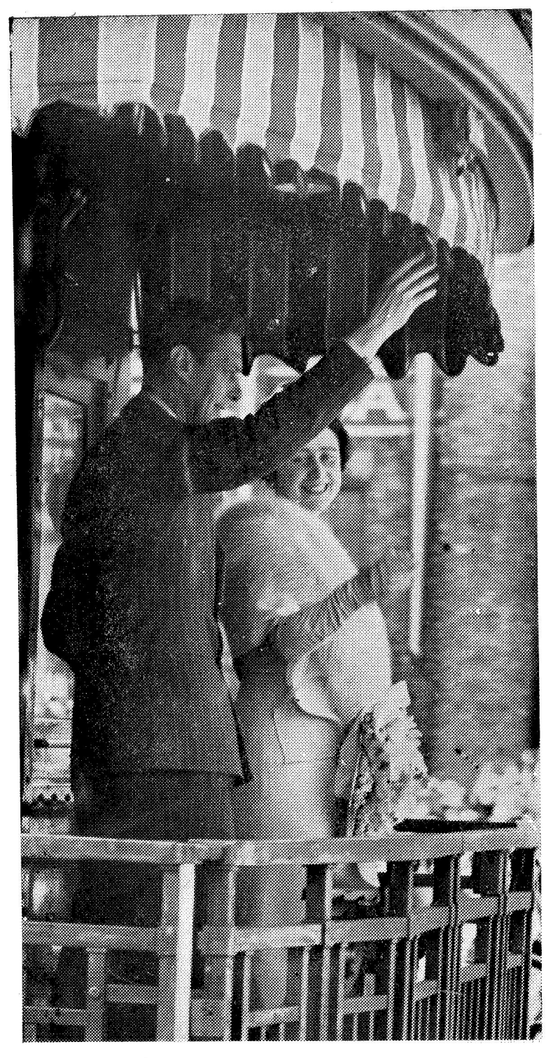
KING GEORGE AND QUEEN ELIZABETH JUNE 6th, 1939