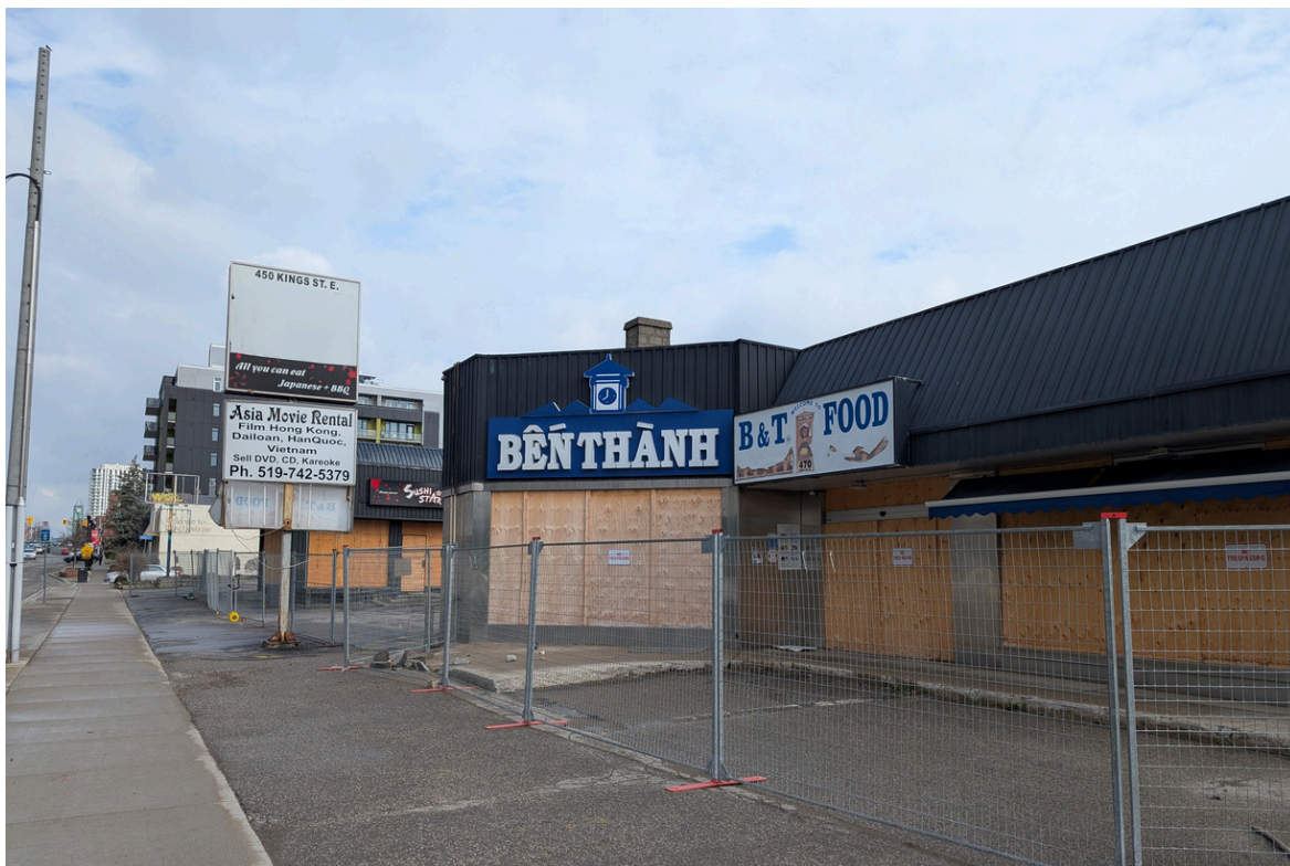
This building at 470 King St. E. was the home of Nels Shantz Motors Ltd. in 1949. It was demolished in 2025.