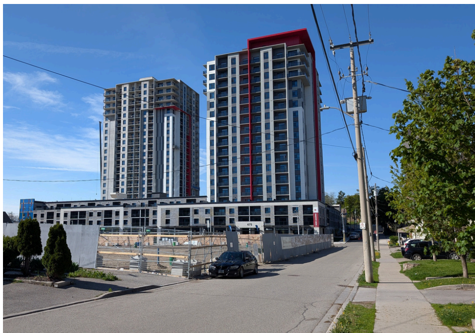
The Vertikal apartment towers are being completed on the south side of King Street East between Madison Avenue and Cameron Street. On the north side of King in the foreground, the City of Kitchener plans to build a fire station and a 19-storey Kitchener Housing Inc. apartment building. This view looks along Madison Avenue.