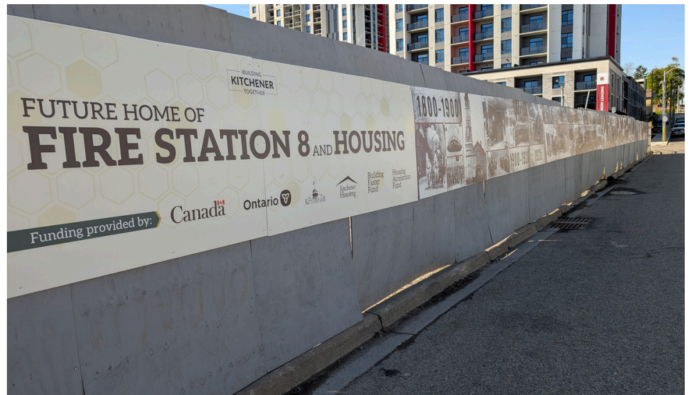
The City of Kitchener is displaying old fire department images on the construction hoarding along Madison Avenue North near King Street East.