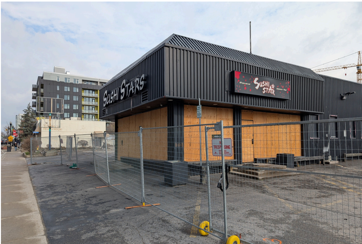
The former showroom of Hall Automobiles Ltd. at 450 King St. E., demolished in 2025.