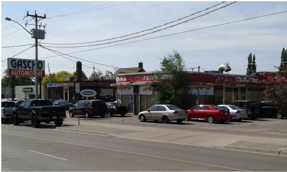
This 2016 image shows the Gascho Automotive building at 481 King St. E. In 1949, the building to the right was the home of Stevens Motors Ltd.