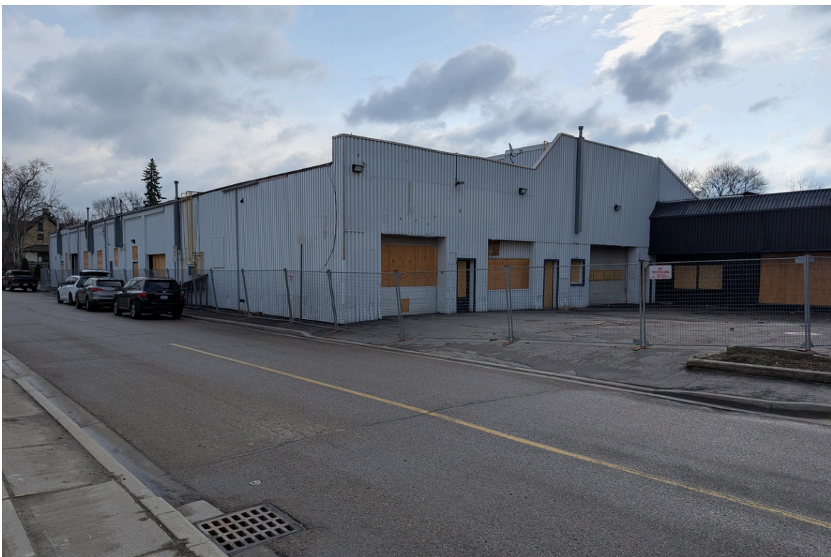
Demolished in the last year, this building at 450 King Street E. and Madison Avenue North in Kitchener was part of the Hall Automobiles Ltd. site in 1949. It incorporated part of a Berlin & Waterloo Street Railway car barn built in 1902.

-Gascho Motors Ltd. at 481 King St. E., featuring Nash and Reo vehicles.