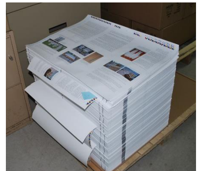
Seeing the printing process and uncut pages of the book was a highlight.