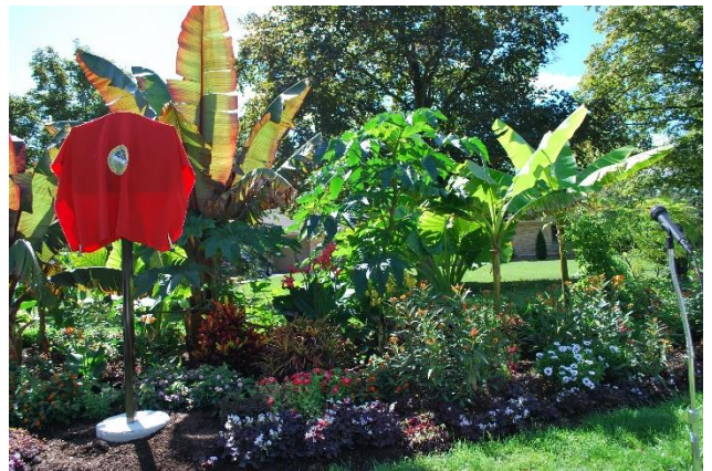
City of Kitchener staff maintain this beautiful garden.

https://www.waterloochronicle.ca/news-story/9597421-local-industrialist-created-vision-of-westmount/